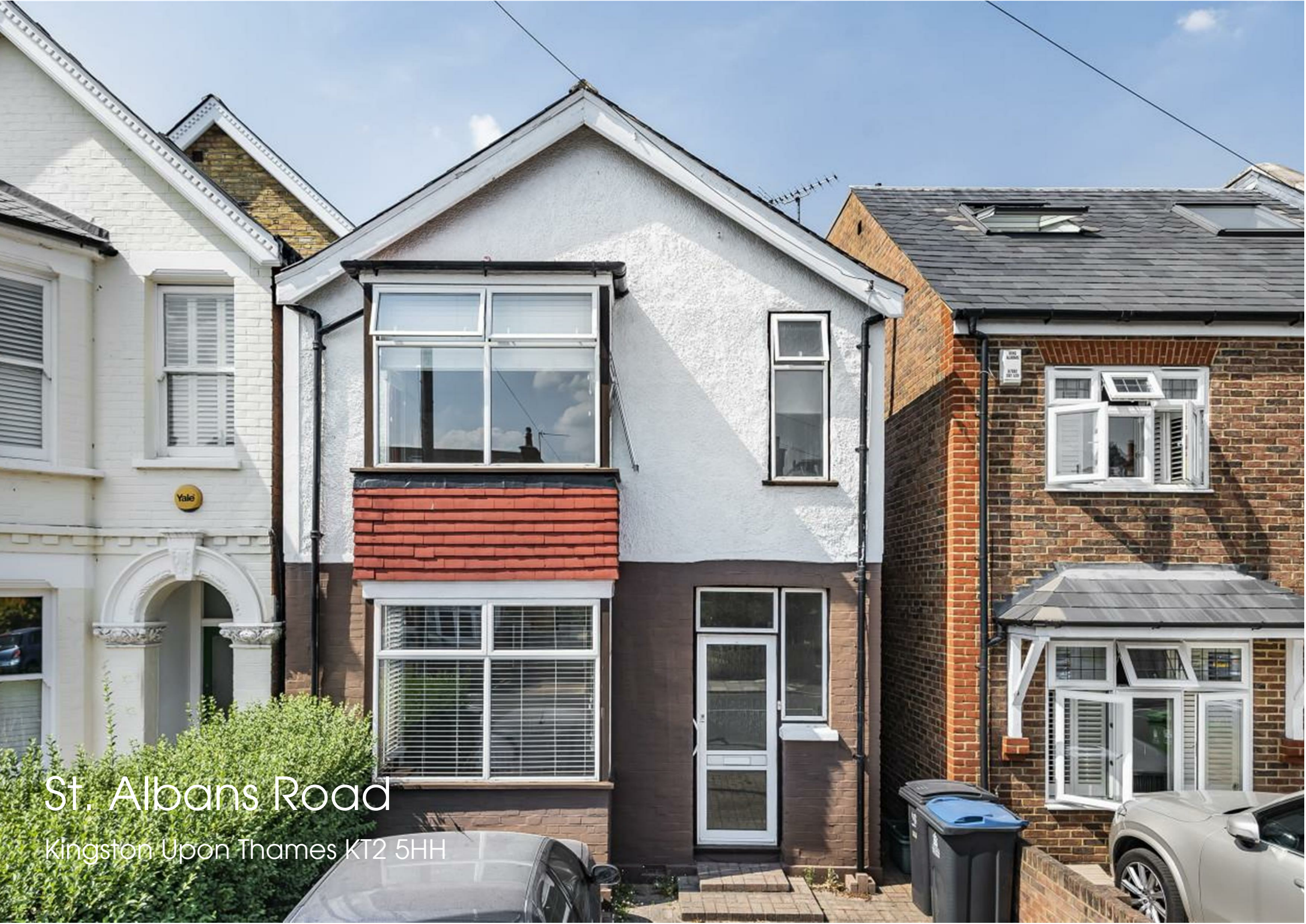
St. Albans Road Kingston Upon Thames KT2 5HH